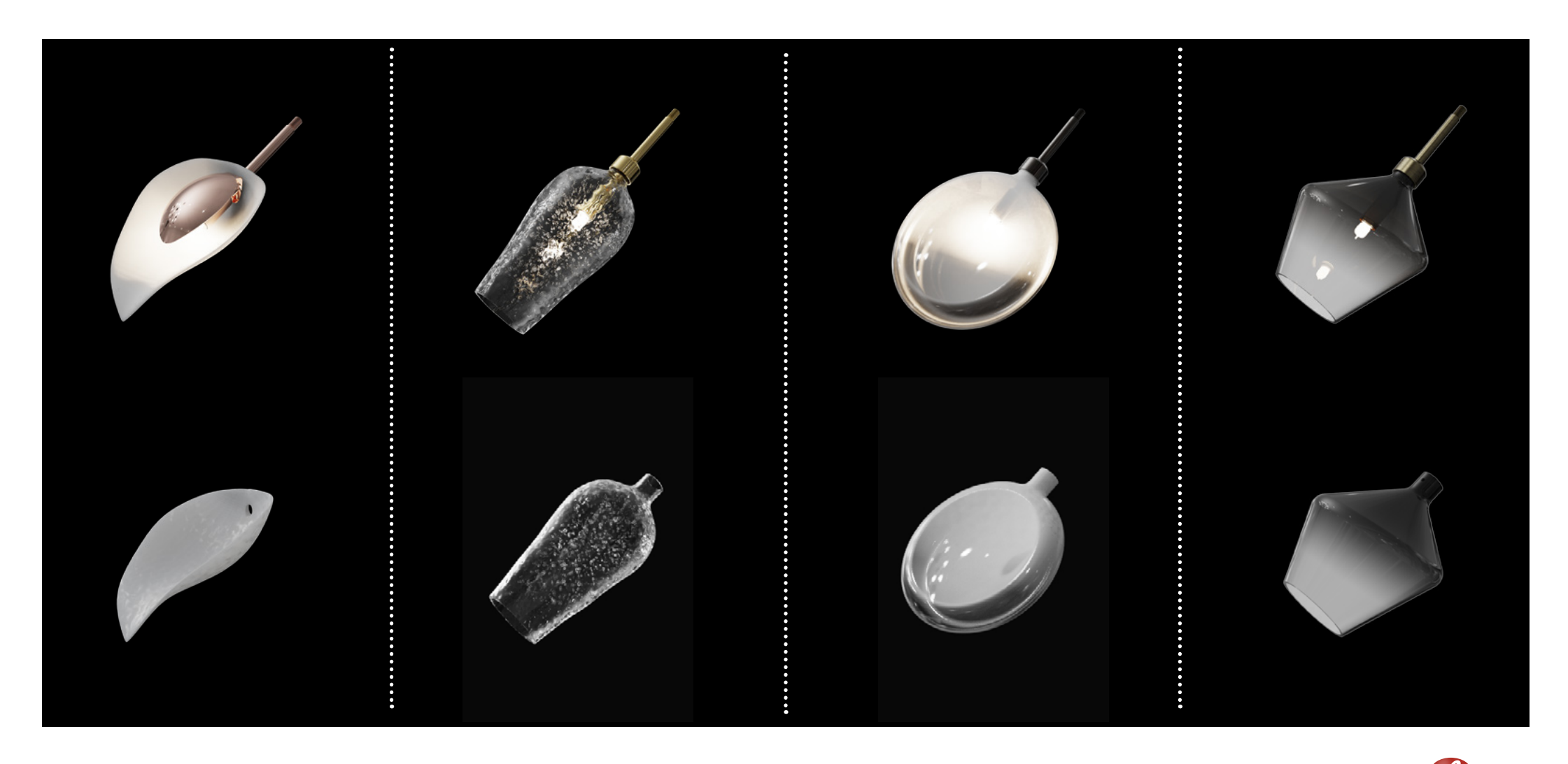
Index Porcelain and glass diffusers